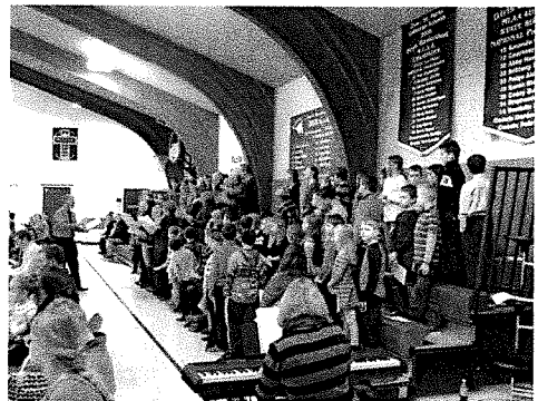
Choirs @ NLSW Service