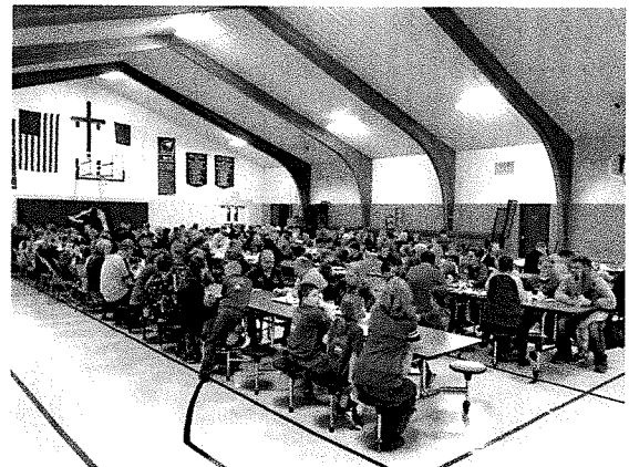
Lunch with Parent/Grandparent