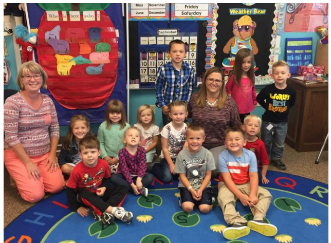
Welcome 4 Yr. Old Preschoolers