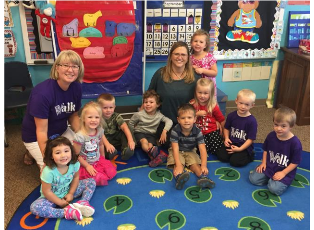
Welcome 3 Yr. Old Preschoolers