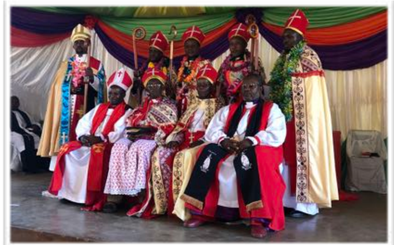
The Consecration of Five New Bishops for the LCEA