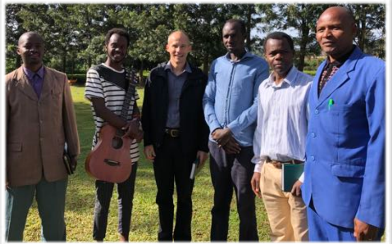
My Brothers in Christ at Matongo After My Appendectomy