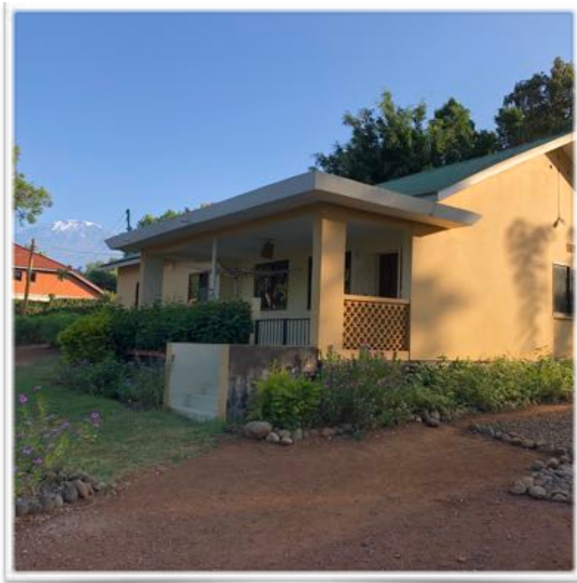
Our New House in Moshi with Kilimanjaro in the Background

Please pray for the Lutheran Church in East Africa and my service at Himo in the new year. A blessed Advent and merry Christmas to you!