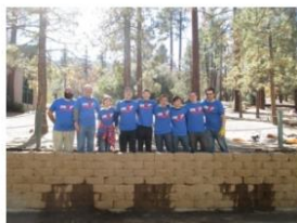
Building a Wall