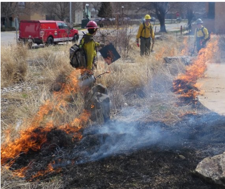
Firefighters use hand tools and spray from the brush truck fire hose to keep the blaze under control.