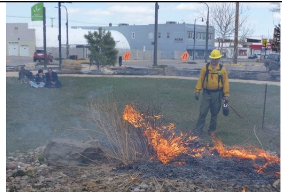
A couple passersby and their dog pause in the Park to take in the fiery display.