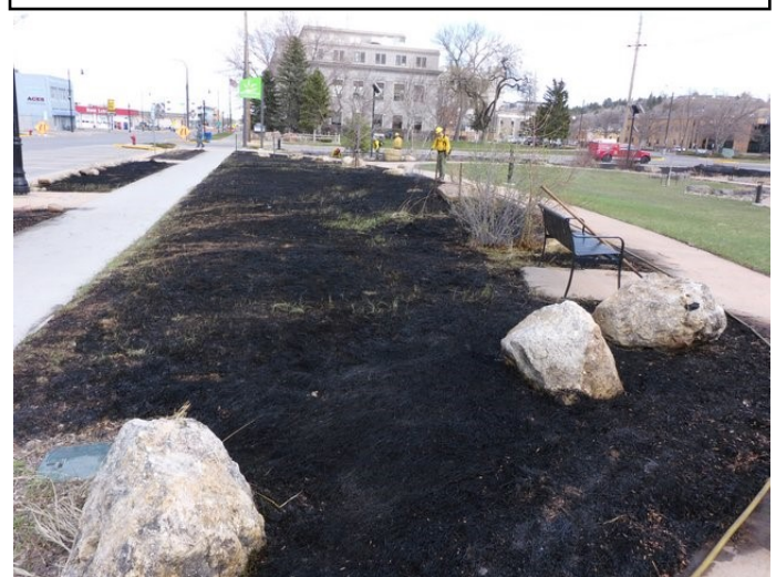
The fire leaves behind a thick blanket of sooty ash and stubble.