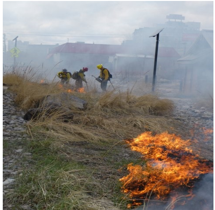
Rapid City Fire Department Wildfire Mitigation Team set fire to the prairie cordgrass along the Park's wetland channel.

See the Park Facebook page ( facebook.com/trinityecoprayerpark ) for a KOTA news story about burning the Park and some blazing video footage.