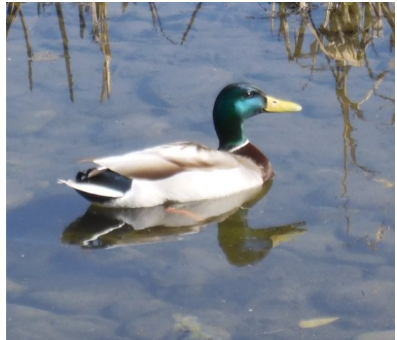
The male mallard returns after the fire while the park is still smoldering to paddle in the pond.

But this year the ducks made an even faster return. After the flames were all out, while the fire crew circulated through the Park to tend smoldering hot spots, the male mallard swooped in for a landing on the pond apparently undeterred by the dense stand of prairie cordgrass that had been reduced to charred stubble around the pond.