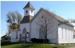
And First Lutheran of Jordan, Sterling, IL