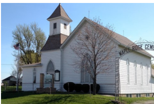
First Lutheran of Jordan, Sterling, IL