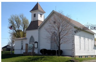
And First Lutheran of Jordan, Sterling, IL