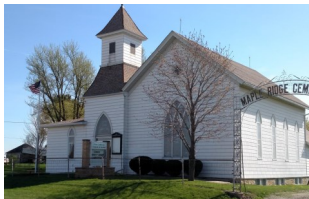
And First Lutheran of Jordan, Sterling, IL