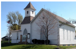
And First Lutheran of Jordan, Sterling, IL