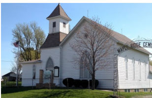
And First Lutheran of Jordan, Sterling, IL