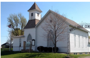
First Lutheran of Jordan, Sterling, IL