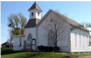
And First Lutheran of Jordan, Sterling, IL