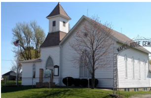
First Lutheran of Jordan, Sterling, IL