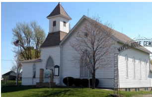
And First Lutheran of Jordan, Sterling, IL