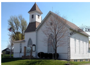
First Lutheran of Jordan, Sterling, IL