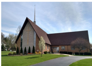
Trinity Lutheran Church Milledgeville, IL