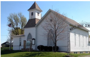
First Lutheran of Jordan, Sterling, IL