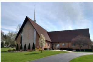
Trinity Lutheran Church Milledgeville, IL