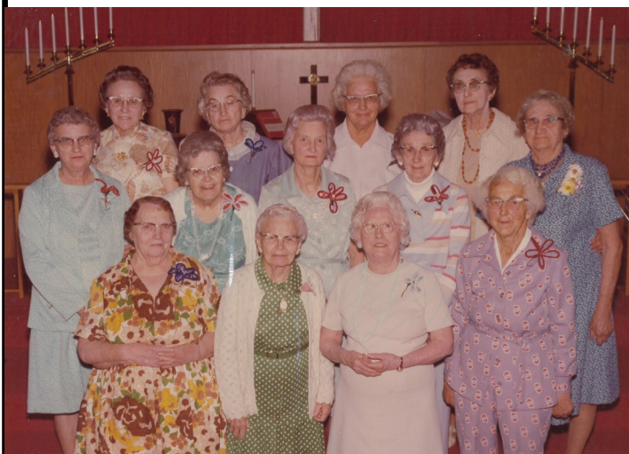
Trinity's Bold Women of the past.