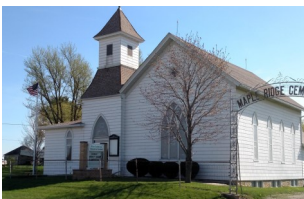
First Lutheran of Jordan, Sterling, IL

R T R B E A U T I F U L U O Y G N I S I O G L E M S U I A C E P E B T G U E O B A A D F E M L L P R A L A E B O G A M E T A G A I N T E R E S T I N G N Y I H N P T O N D N G A N E C N P A S T H A D I S C O V E R E D R U C E A C O N O M I M O E C A S I S D N O T E S I N H T M O M E N T E Y M H R O F G Y K E C I U L E T U C O O L B T C O M I N G H I G U O U H T F O H N B I D A R N T T Y G M T S O O L E D N A Y S A U W H A P P Y R A R D E L L T A C C T T O G T D S U J I H O E O K U S E F U L N E S S M Y Z I A E R C D N F I G U R E D U O N S D T S U M I W O N K I D E A S I