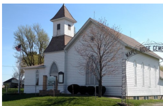
First Lutheran of Jordan, Sterling, IL