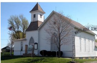
First Lutheran of Jordan, Sterling, IL