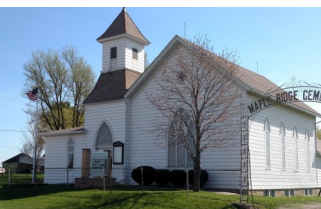
First Lutheran of Jordan, Sterling, IL