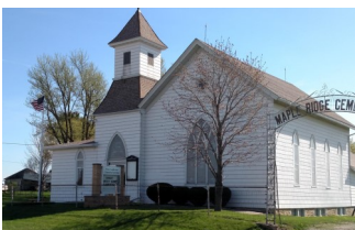
And First Lutheran of Jordan, Sterling, IL