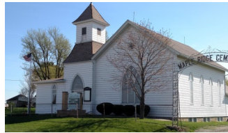
First Lutheran of Jordan, Sterling, IL