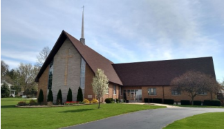
Trinity Lutheran Church Milledgeville, IL