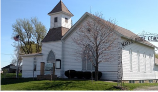
First Lutheran of Jordan, Sterling, IL