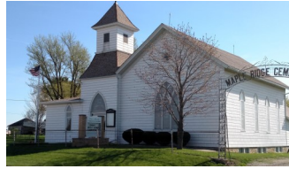
First Lutheran of Jordan, Sterling, IL