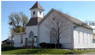
First Lutheran of Jordan, Sterling, IL

The Milledgeville Public Library needs our help repairing its building. Our Noisy Offering and Pancake Supper will go to the Porch fund.