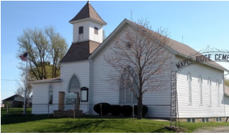
First Lutheran of Jordan, Sterling, IL