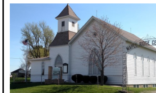
First Lutheran of Jordan, Sterling, IL