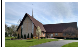
Trinity Lutheran Church Milledgeville, IL