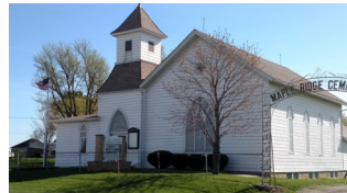
First Lutheran of Jordan, Sterling, IL