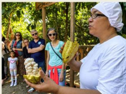
Touring Chokolala during the March 2020 DR FORO.