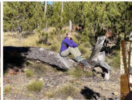
(Left): Soaking up some rays at the Valle de los Lilis rest stop.