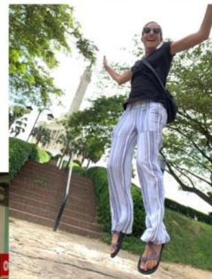
Above: Fun photo op with Santiago's most iconic structure, "The Monument."