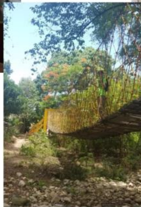
At the start of a beautiful hike whose trailhead is 15 min. away!