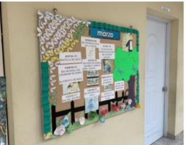
The bulletin board outside my church's parochial preschool is still decorated for...March.