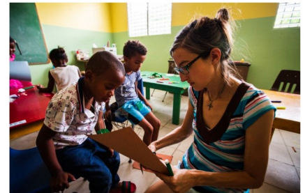
Cutting out footprints that would later point the way to the cross during VBS in Palmar Arriba.

How Lutheran is my new stairwell décor (a triptych outlining the parts of the Divine Service)?