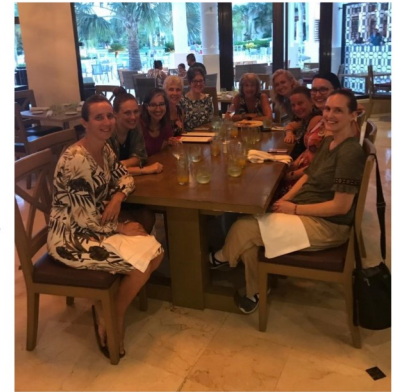
Most of the Regional Team women & wives.

I am encouraged by these individuals' caring support and sharpened by their collective wisdom & experiences!