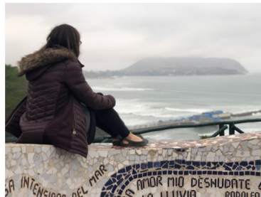
Pondering the Pacific from Parque del Amor in Lima, Peru.

How Lutheran is my new stairwell décor (a triptych outlining the parts of the Divine Service)?