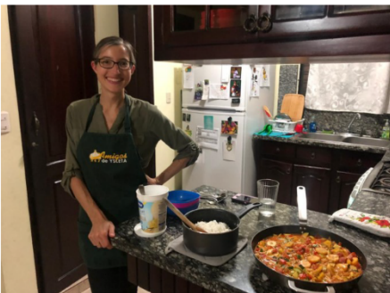
100% in my element!

***(1) through (4) can be found on my TRIED IT! Pinterest board. Tostones are simply thickly sliced green plantains fried, smashed, and fried again.