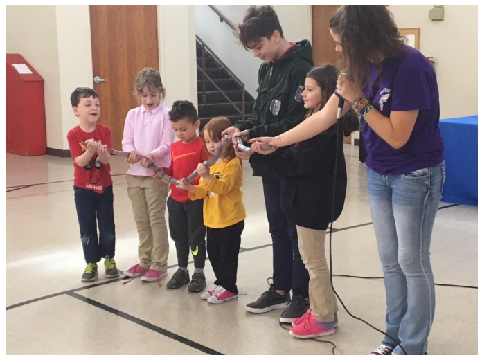
Holding the Snake: The rain forest came to TLCLC & GSLS