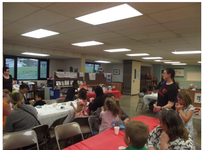
Waiting for their prizes at the Literacy Fair