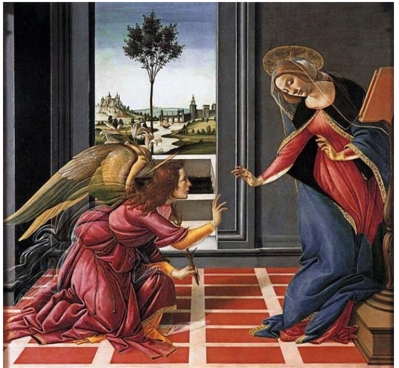
Cestello Annunciation, 1489-90 Sandro Botticelli