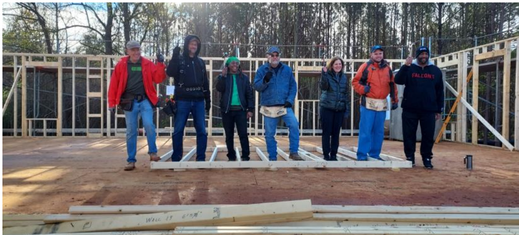
Figure 1 - Photo of First Nail Ceremony