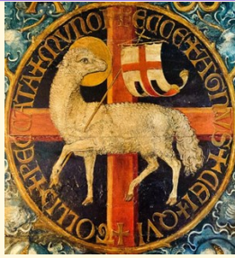
Licensed under CC BY-NC-ND

LWML Zone 8 Spring Rally Shine Jesus' Light Trinity Lutheran Church 33930 N. State Road, Genoa, IL Saturday, April 6, 2024 9:00 am – 2:00 pm