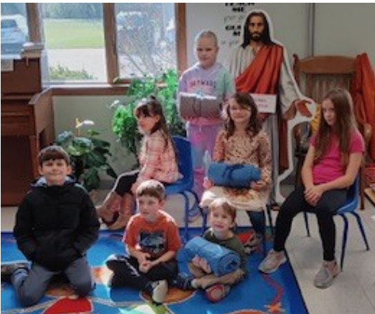
This past Sunday, the children of St. Peter's Sunday School packed boxes for Orphan Grain Train, which will be delivered to the fire victims in Maui.