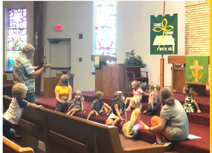
First Chapel of the Year

October's prayer idea: Take a nature walk and gather items of interest, such as rocks, leaves, or a piece of fallen fruit. When you return home, say a prayer of thanksgiving for each of those items, which God created for our use and enjoyment.