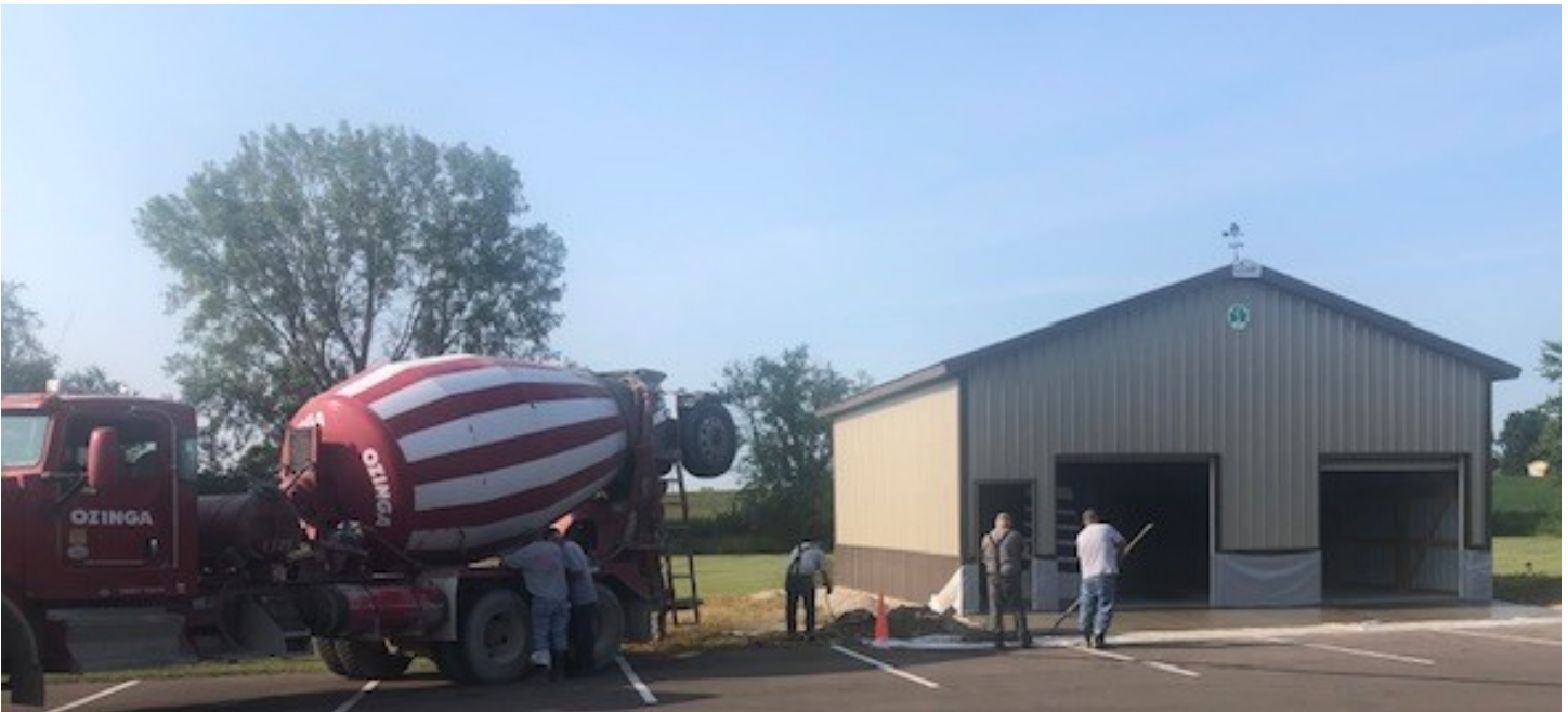
Hard at work finishing the Pole Barn by pouring the apron.