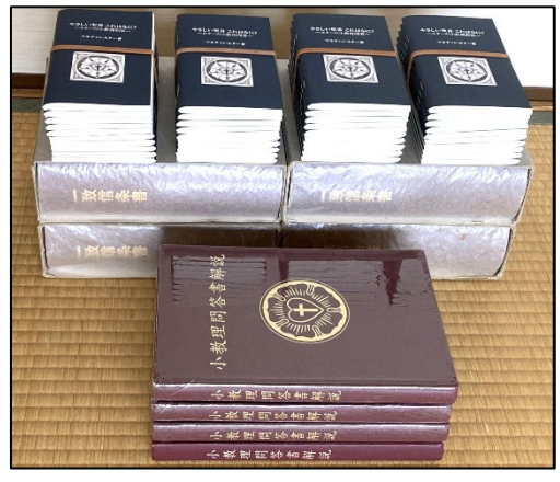
May Conference Supplies

Not to overlook Lutheran resources of the past, my long-standing ambition to accurately organize an up-to-date time-line chart