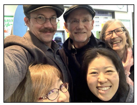
Numata, Gunma Prefecture

Whether far south in Kyushu or somewhat north in Gunma, we LCMS missionaries in far parts deliver life and salvation through pastoral visitation.