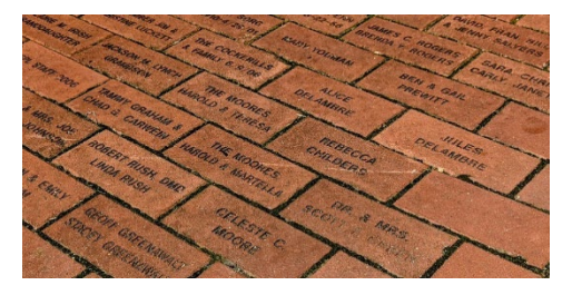
Bricks for the patio of the Columbarium are now for sale for $100. Order forms are in the Narthex on the rolling table. You can put your order in the offering plate.

Purchase your Brick in Honor or Memory of your Loved one. Now Available!