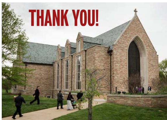
Pictured is the Chapel of St. Timothy and St. Titus at Concordia Seminary, St. Louis.