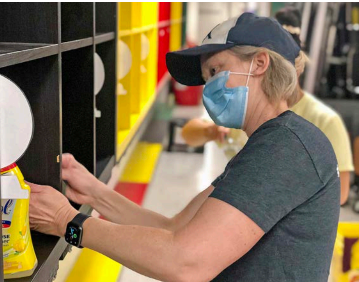
Members from Family of Christ clean cubbies for fourth and fifth grade.