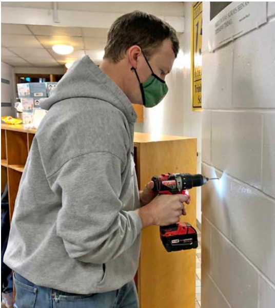
▼ A member of Family of Christ preps a wall to anchor cubbies for the K3 class.