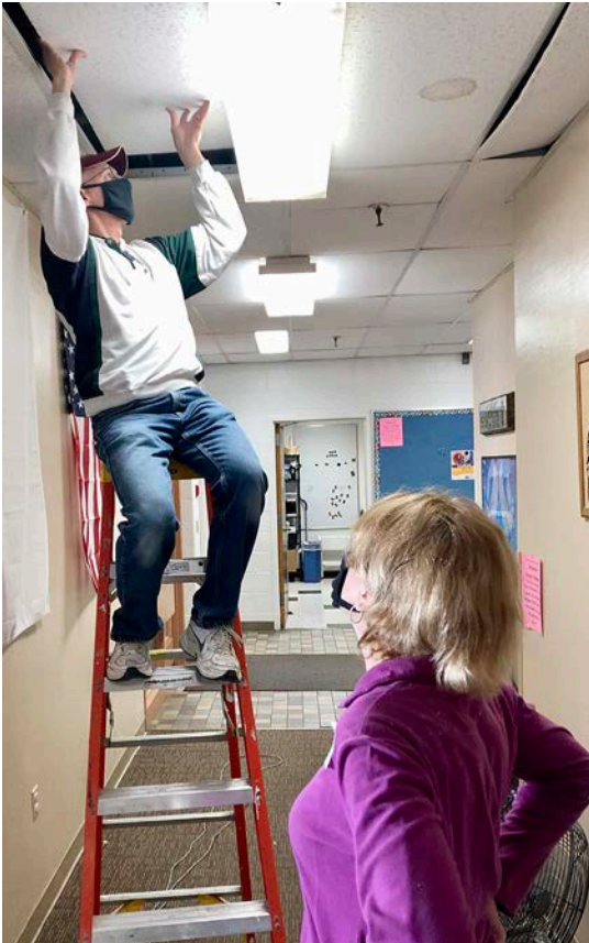
▲ Members of Woodbury Lutheran and Family of Christ remove ceiling tiles to run a new Ethernet cable to a staff office.