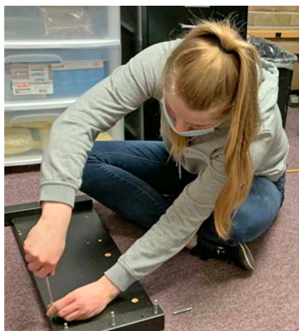
A Woodbury Lutheran Church member puts together furniture for an office.

Trinity First has a unique ministry, serving a demographic in which 75 percent are below the poverty line, 46 percent are immigrants and 60 percent are non-churched. At Trinity First, families from all backgrounds experience high-quality education, from kindergarten-3 through eighth grade, and have access to helpful tools like parenting classes. They also frequently hear the message of hope and salvation in Jesus.