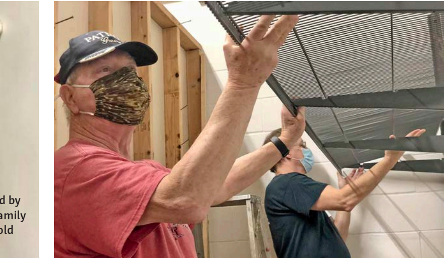
Two Woodbury Lutheran Church members install a shelf in a storage closet.