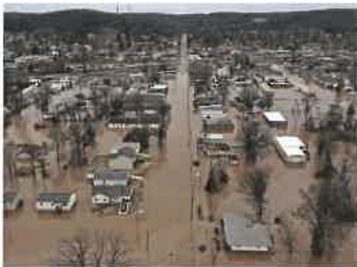
December 29, 2015