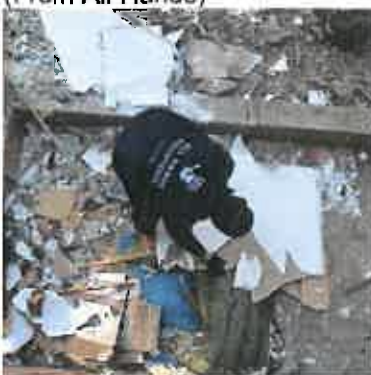
(From All Hands)