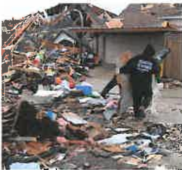
(From All Hands)