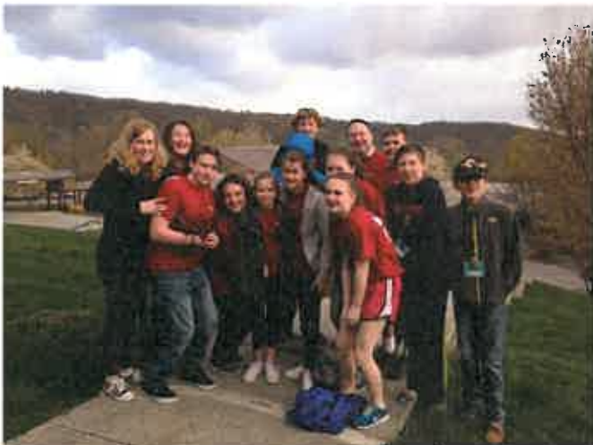
Shekinah - amazing weekend confirmation retreat with StLuthRef seventh and eighth graders and Metro DMV youth.

Inspired by Martin Luther's speech before the Diet of Worms, the youth used Luther's immortal words " Here I Stand " to explore the many ways that they could put on the armor of God to do great things in the world.