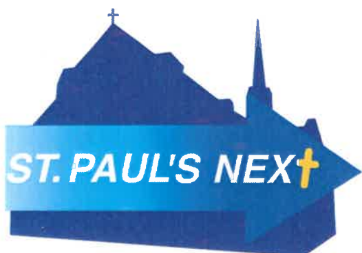
Table Talks Begin