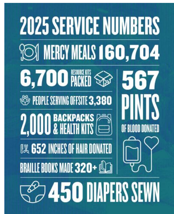
The group put together some of the 160,704 mercy meals.