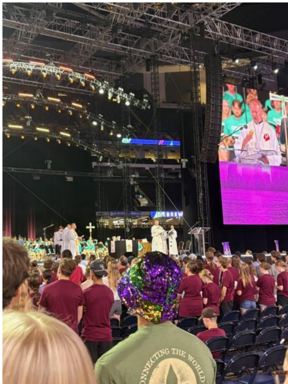
At the closing worship service with 20,000 other attendees.